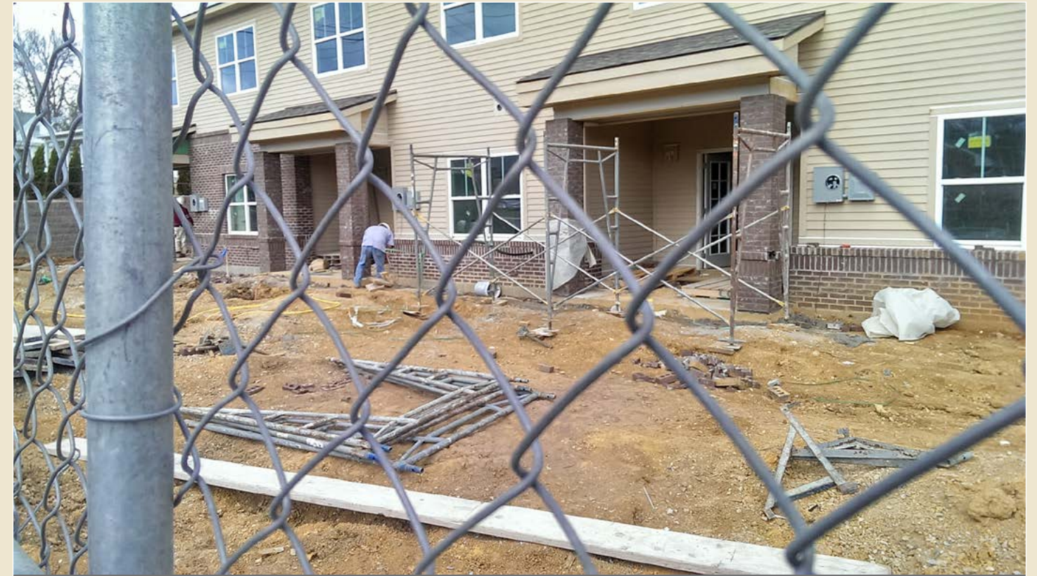
After construction this area will be planted with trees, shrubs, and turf. Heavy grading and a confined building site have resulted in severe soil compaction that is a prime candidate for SPR.

increase growth rates, improve soil permeability for stormwater management, increase soil carbon stores, and help meet soil restoration requirements for projects seeking SITES certification (Sustainable Sites Initiative, sustainable-sites.org ). Urban foresters can use SPR to rehabilitate soils damaged by construction and development and set them on the path to long-term recovery. The procedure is relatively simple—deep mixing of high quality compost with existing soil followed by planting trees or shrubs.