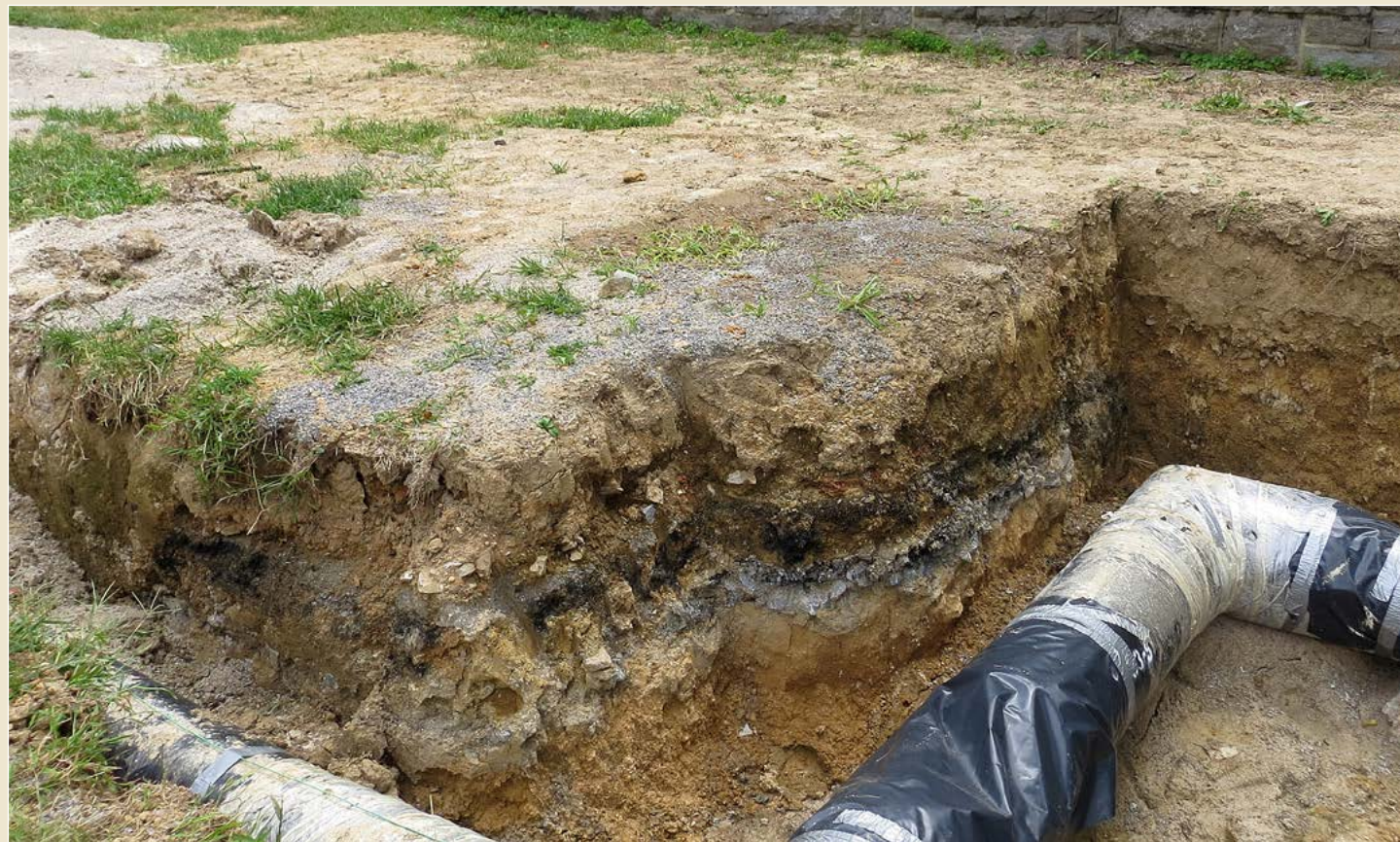
This site is a good candidate for SPR because soil is compacted and has an impermeable layer that can likely be broken up by the backhoe subsoiling process. Note limestone gravel mixed in soil indicates pH will be high, which will not be altered by the rehabilitation process. Surface gravel should be removed if possible and underground infrastructure clearly marked.

SPR works by creating veins of compost deep in the soil profile that hold soil channels open for root penetration. The introduction of organic matter coupled with root activity can create conditions that will lead to formation of soil aggregates over time—leading to long-term soil quality enhancement.