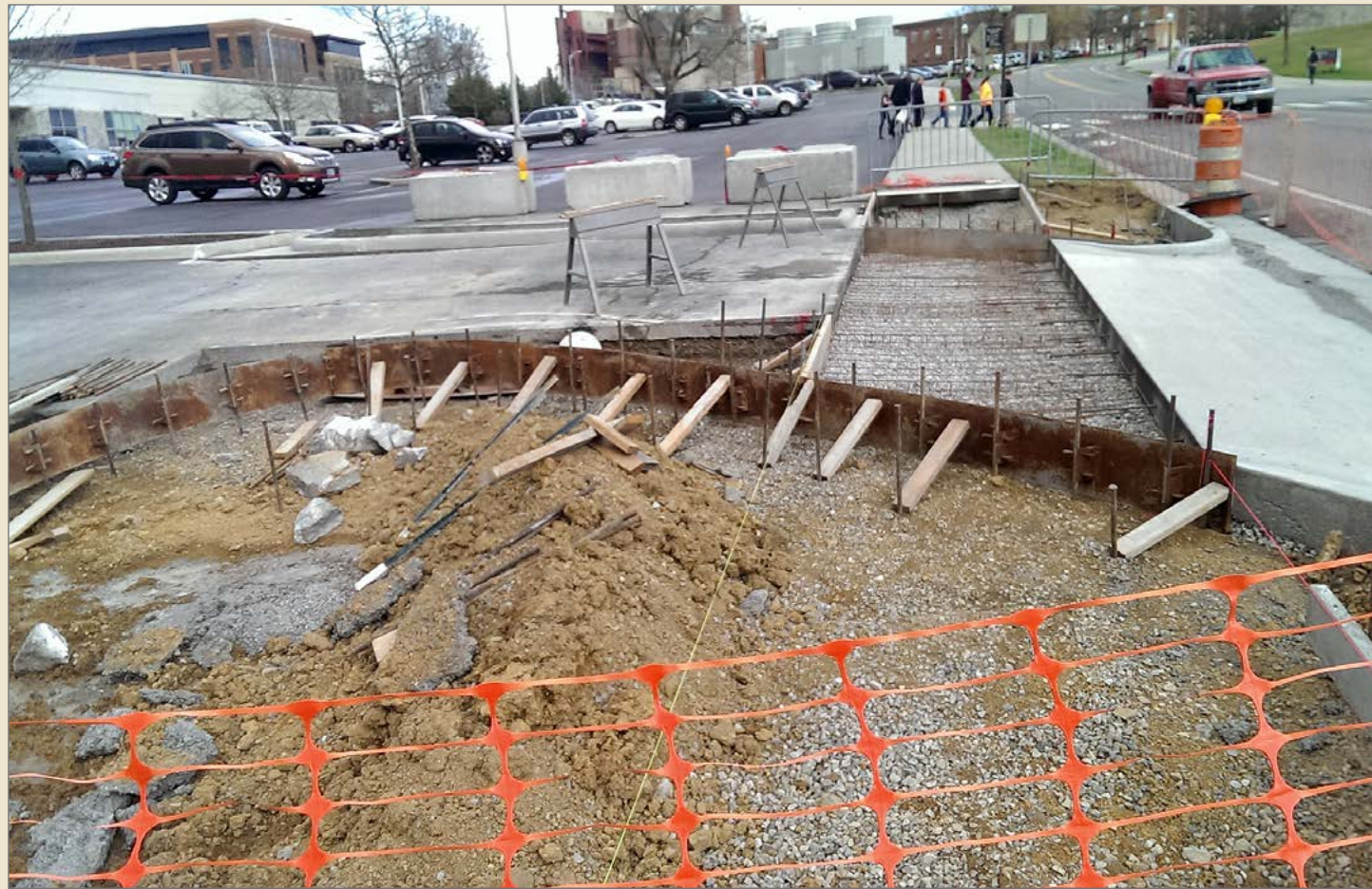
To the left of the sidewalk is a tree pit that is an excellent candidate for SPR. In spite of its reasonably generous size, the prognosis for trees planted in this area is poor unless soil quality is improved. The backhoe subsoiling technique allows for soil manipulation even in such confined spaces.