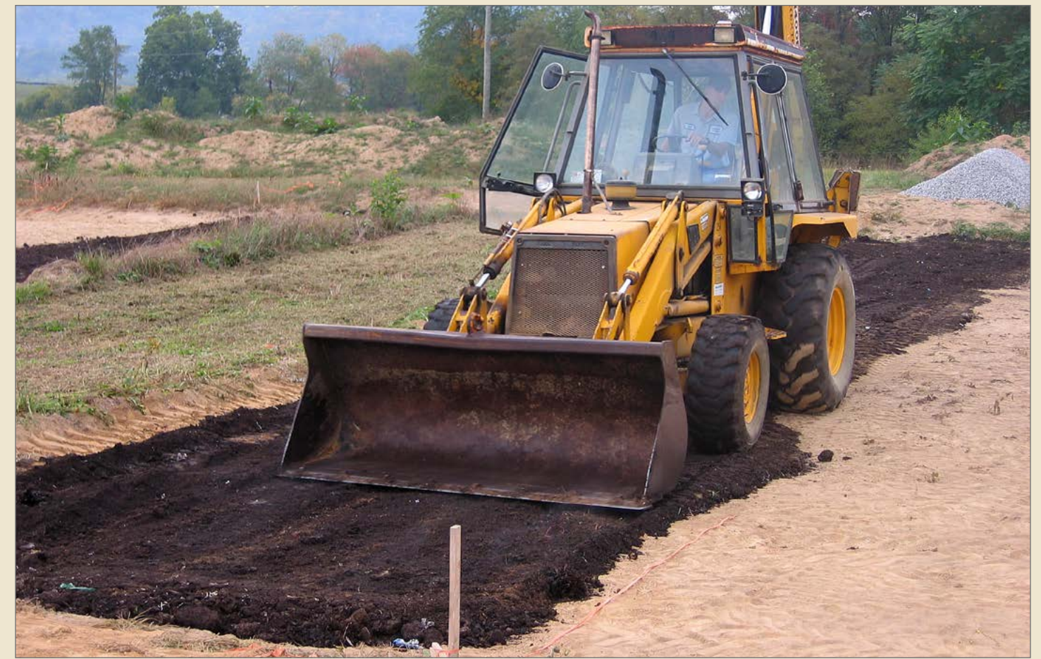
Compost is spread 4 inches (10 cm) deep over the surface of the existing soil.