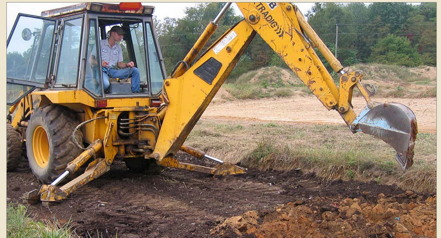
With backhoe subsoiling, the operator scoops a bucket of soil with compost on the top, lifts it several feet in the air, and drops it. This technique allows work in tight spaces such as street medians, breaks up compacted soil into large clods, and makes it possible to create veins of compost down 24 inches (61 cm).